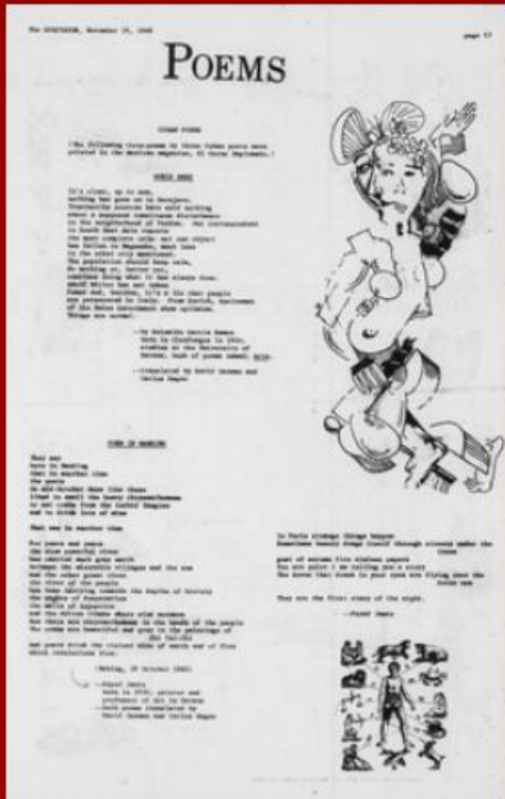
Cuban poems published in November 19 th , 1968 edition of The Spectator

Demonstration for and against Cuban blockade decision made by President Kennedy.